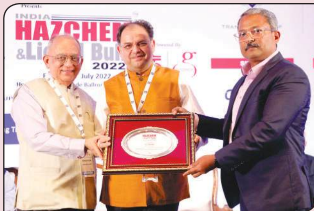
Zodiac Tank Container Terminals Pvt. Ltd

For its initiative to develop a state-of-the-art world class tank cleaning facility in India